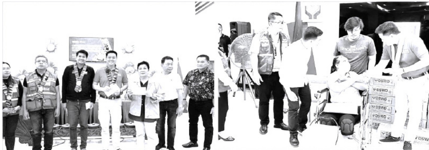
Department of Social Welfare and Development (DSWD) Secretary Rex Gatchalian hands over on Wednesday, March 22, 2023, the financial assistance donated by the People's Republic of China (PRC) and the Government of Hungary, along with the family food packs and hygiene kits from the Department, to the victims of the 2019 Sulu (left) and Zamboanga City (right) bombing incidents.

The Department of Social Welfare and Development (DSWD) distributed financial assistance amounting to P35,850,000.00 and P1,672,691.00 from the Government of Hungary, on Wednesday, March 22, to the victims of the 2019 Sulu and Zamboanga City bombing incidents.