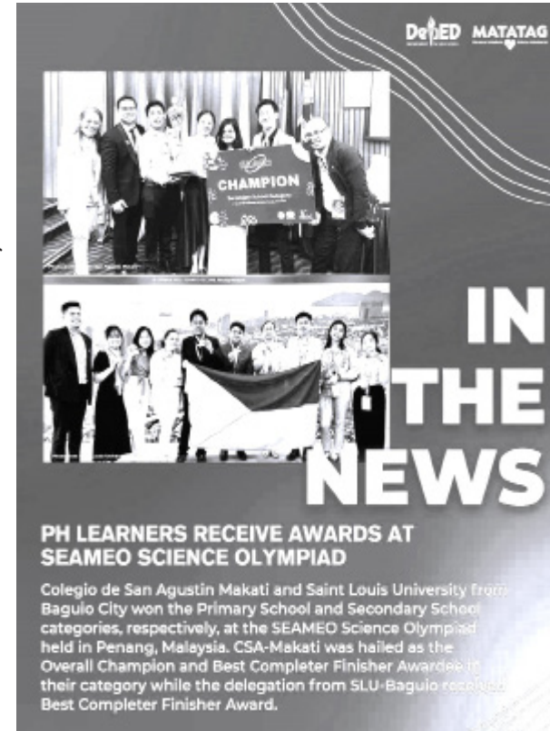
PH LEARNERS RECEIVE AWARDS AT SEAMEO SCIENCE OLYMPIAD Colegio de San Agustín Makati and Saint Louis University from Baguio City won the Primary School and Secondary School categories, respectively, at the SEAMEO Science Olympiad held in Penang, Malaysia. CSA-Makati was hailed as the Overall Champion and Best Completer Finisher Awardee in their category while the delegation from SLU-Baguio received the Best Completer Finisher Award.